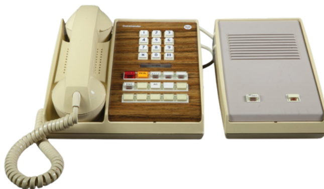
Telecom Commander N308 with Speaker Unit c1980s MUSEUM OF AUSTRALIAN DEMOCRACY COLLECTION