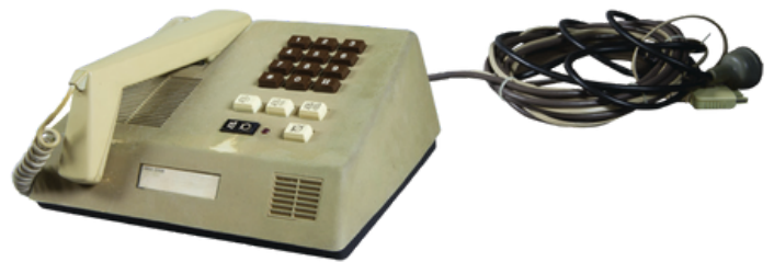
STC Loudspeaking Deltaphone c1970s MUSEUM OF AUSTRALIAN DEMOCRACY COLLECTION