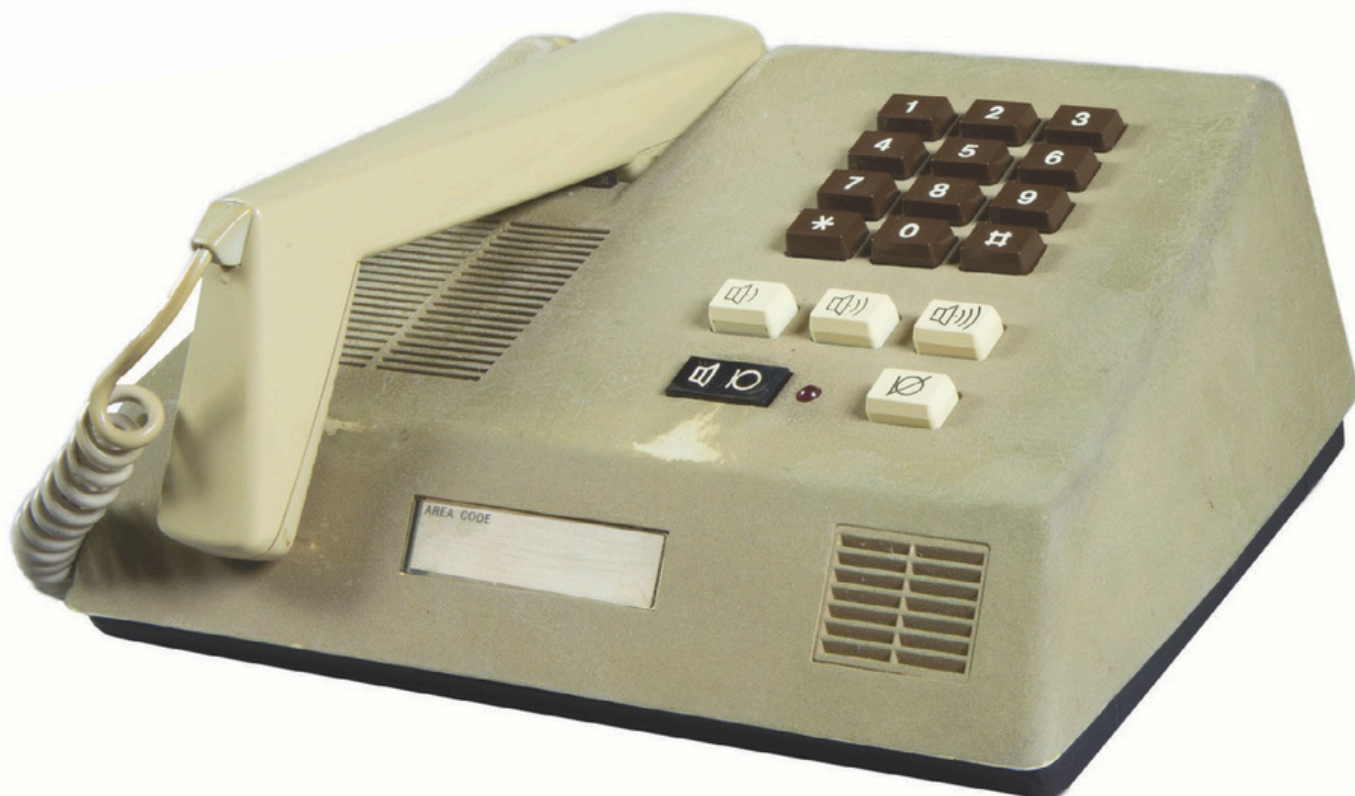
STC Loudspeaking Deltaphone c1970s MUSEUM OF AUSTRALIAN DEMOCRACY COLLECTION